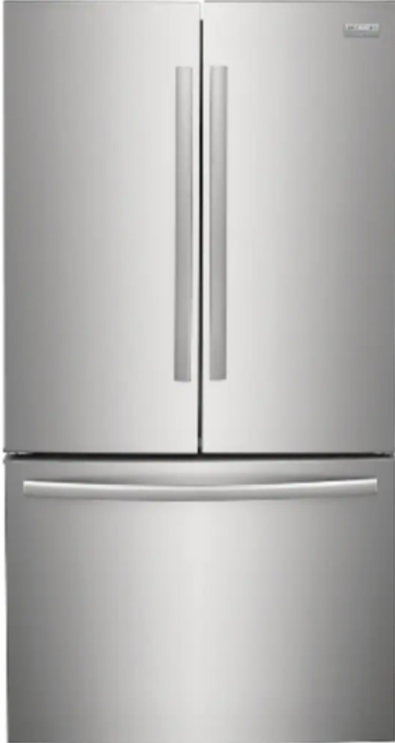
Frigidaire Fridge (grfg2353af)