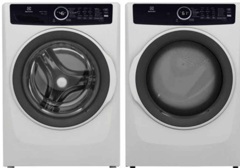
Electrolux Front Load -Washer and Dryer Combo (ELFW7437AW, ELFE743CAW)