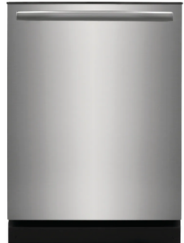
Frigidaire Dishwasher (fgid2476sf)