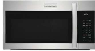
Frigidaire Over The Range Microwave (gmos1962af)