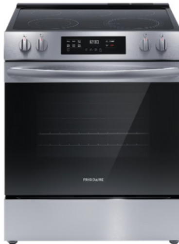
Frigidaire Range (cgeh3047vf)